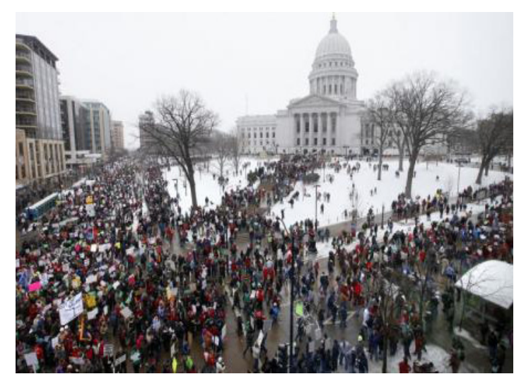
Wisconsin Capitol 2011 protests

in overturning the law by statewide referendum in November 2011.