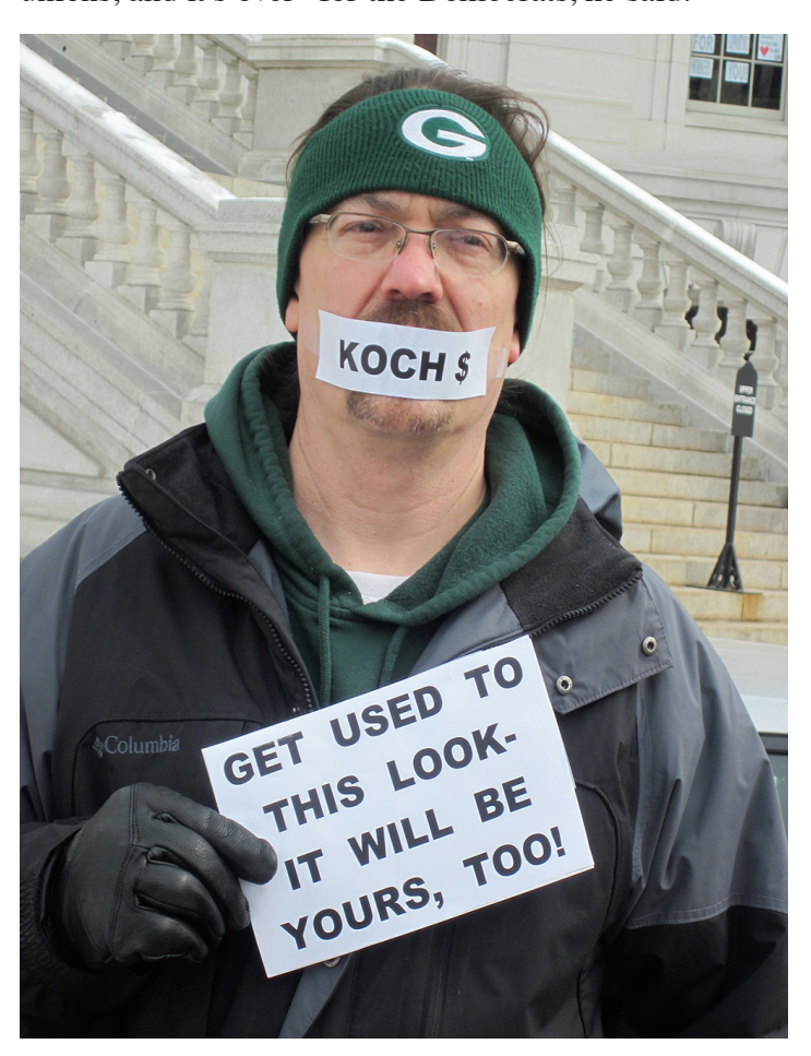
Wisconsin Capitol protestor 2011

While ALEC and its supporters frame their actions as fiscally responsible and pro-worker, it is clear that this is a deeply political agenda. An analysis by the Economic Policy Institute (EPI) shows that, on the whole, these types of bills don't create new rights for employees but "significantly tilt the political playing field by enabling unlimited corporate political spending while restricting political spending of organized workers." Fox News reporter Shepard Smith put it even more bluntly. He noted that of the top 10 political donors in the United States, only three donated to Democrats -- all unions. "Bust the unions, and it's over" for the Democrats, he said.